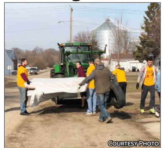
Champions worked through Frederick as they cleaned up miscellaneous items placed for pickup.