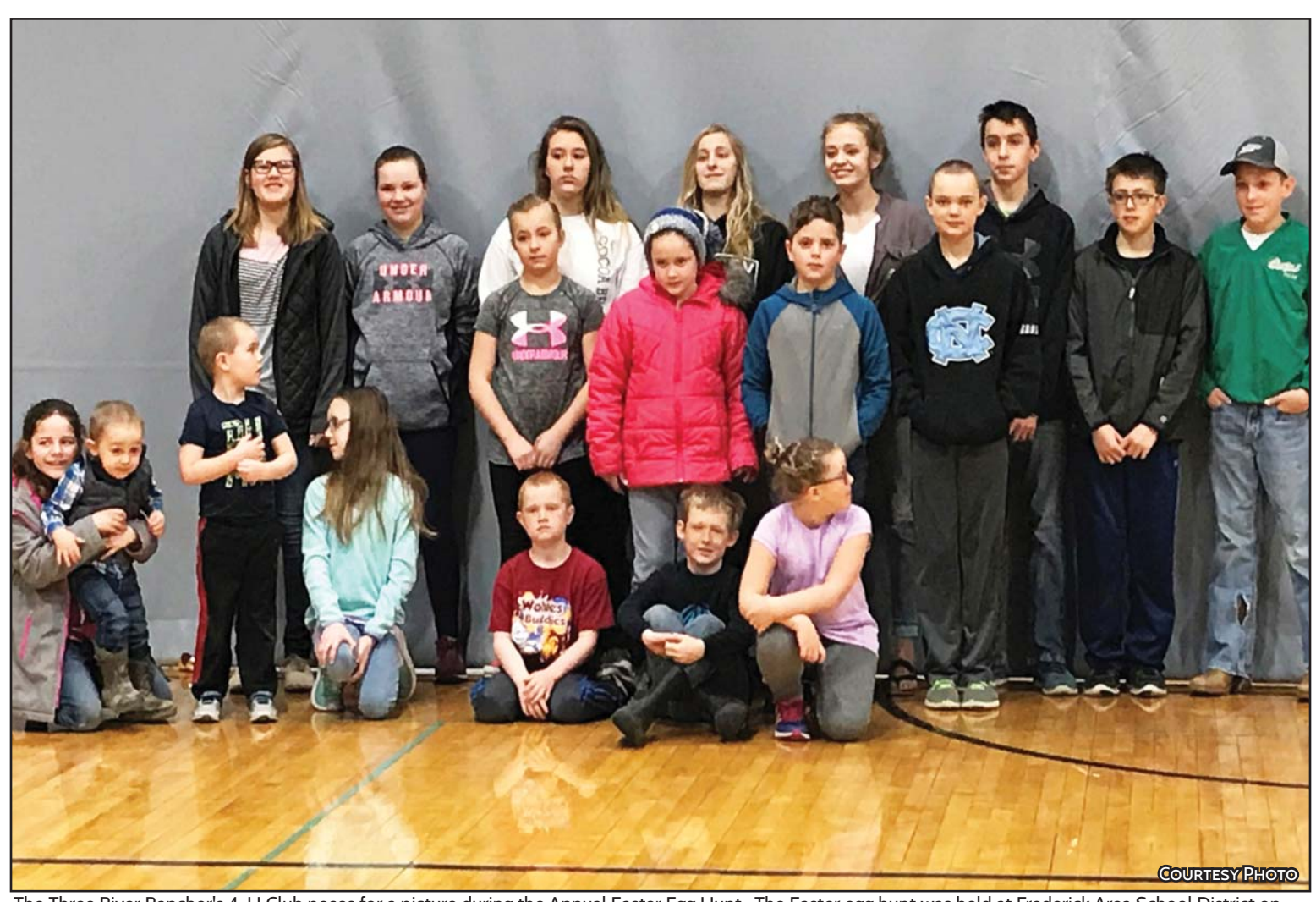
The Three River Rancher's 4-H Club poses for a picture during the Annual Easter Egg Hunt. The Easter egg hunt was held at Frederick Area School District on Saturday, March 31st.