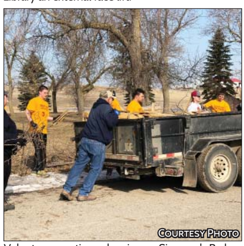
Volunteers continue cleaning up Simmon's Park.