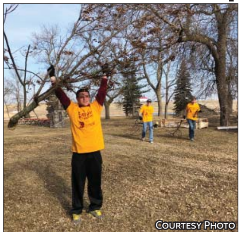
This NSU student celebrates as he clears this large branch from Simmons Park.