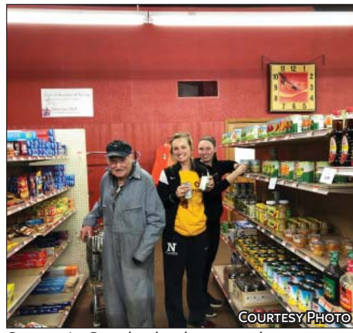
Community Store local and remote volunteers taking in the Saturday together.