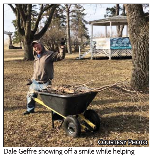
clean up Simmon's Park in Frederick.