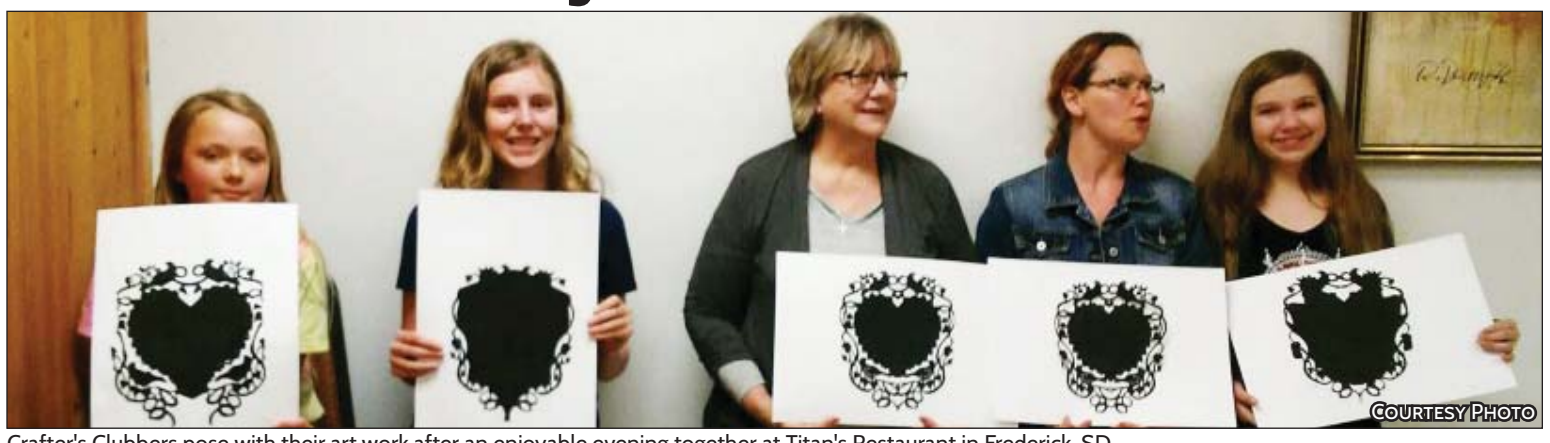
Crafter's Clubbers pose with their art work after an enjoyable evening together at Titan's Restaurant in Frederick, SD.