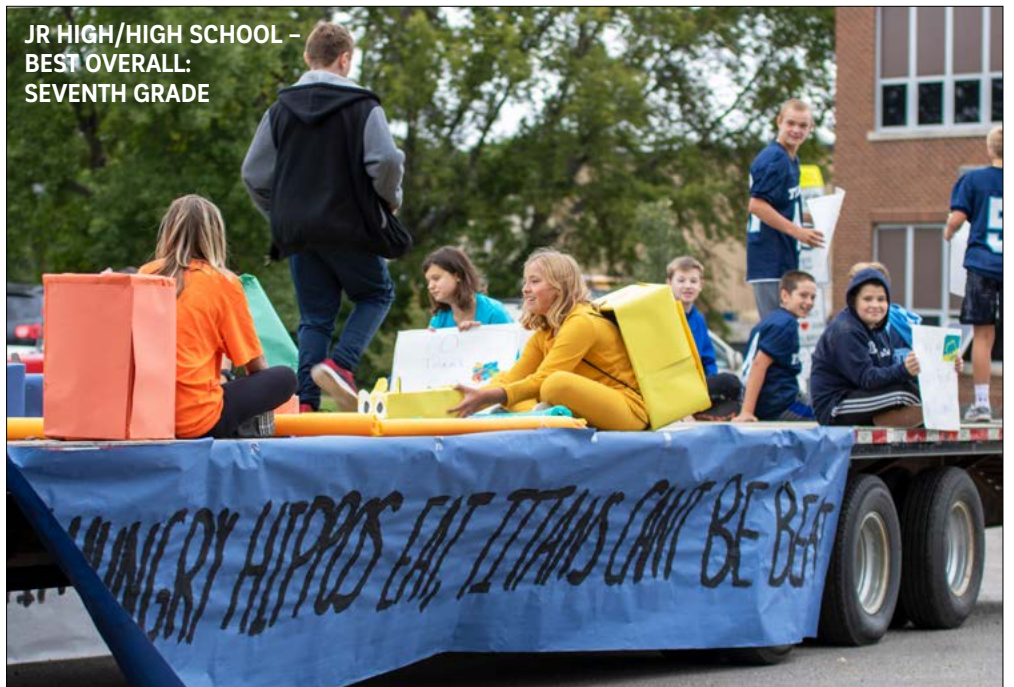
JR HIGH/HIGH SCHOOL - BEST OVERALL: SEVENTH GRADE