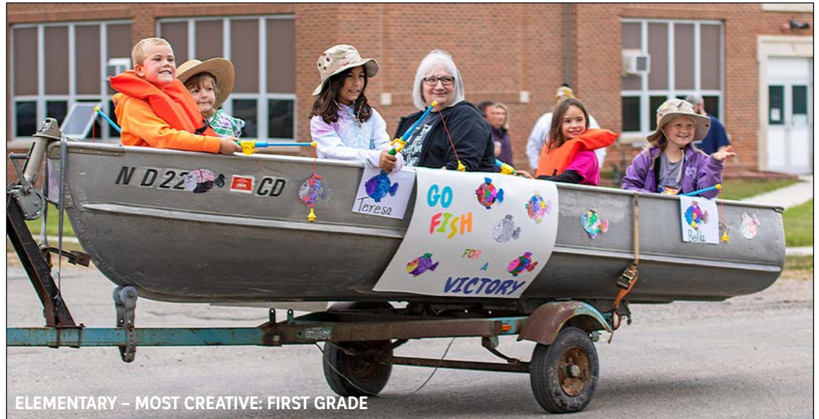
ELEMENTARY - MOST CREATIVE: FIRST GRADE