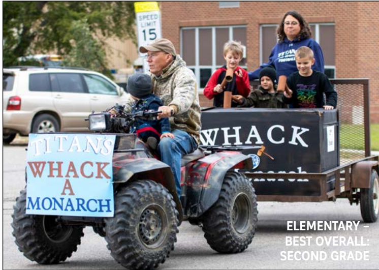
ELEMENTARY – BEST OVERALL: SECOND GRADE