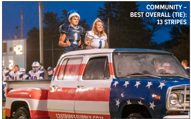
COMMUNITY – BEST OVERALL (TIE): 13 STRIPES