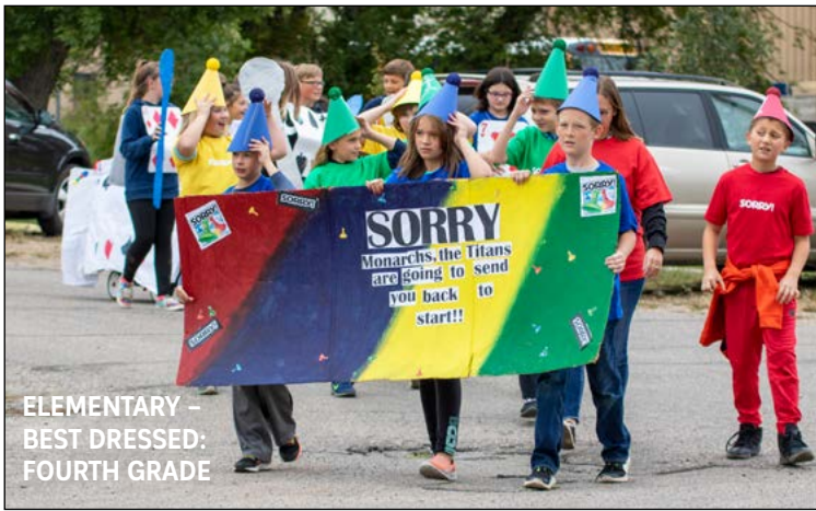
ELEMENTARY – BEST DRESSED: FOURTH GRADE