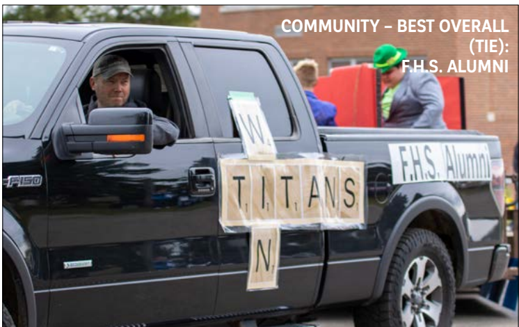
COMMUNITY – BEST OVERALL (TIE): F.H.S. ALUMNI