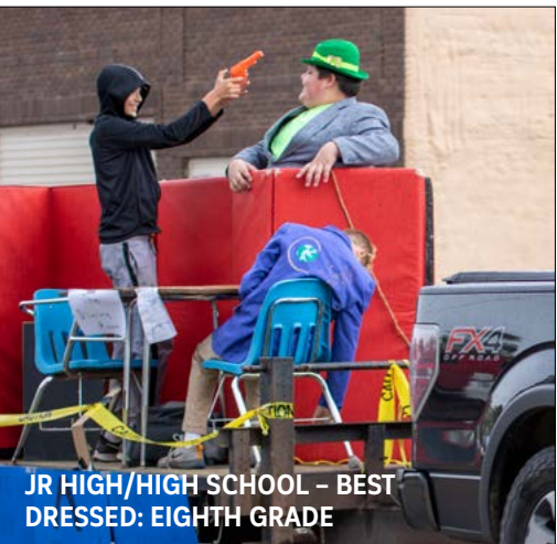
JR HIGH/HIGH SCHOOL - BEST DRESSED: EIGHTH GRADE