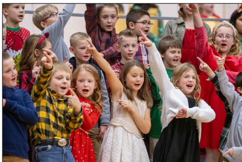
ABOVE: Students added some dramatic actions to the story of the little bell. RIGHT: A rendition of "Feliz Navidad" by the high school band got the audience into a festive mood.