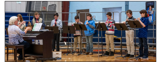
Frederick Area's kindergarten through senior students entertained community members during the annual holiday concert on Dec. 7. LEFT: Elementary students performed a story about a little bell that didn't ring. ABOVE: Sixth- and seventh-grade musicians played recorders. BELOW: The high school chorus sang several numbers.