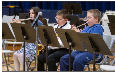
Fifth-grade band members performed together, as well as solos.

Frederick Area F.Y.I., P.O. Box 533, Frederick, SD 57441