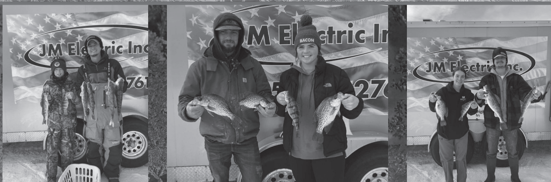
All Teams Registered will have a chance to win A Garmin Livescope Plus Ice Fishing Bundle